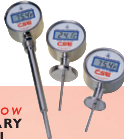
SANI-FLOW SANITARY DIGITAL THERMOMETERS