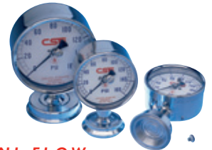
SANI-FLOW SANITARY PRESSURE GAUGES

As the oldest and one of the largest manufacturers of precision instrumentation, we have applied our experience in the design of outstanding gauges, thermometers and thermowells specifically for your applications. Our instruments are built to withstand the strict requirements of food processing, chemical and pharmaceutical plants, and function for many years with little or no maintenance. Our dedication to quality is not only evident in our products, but also in our customer service. We offer immediate availability on all products at reasonable prices. We feel so strongly about the quality of our products and service that we guarantee complete satisfaction.